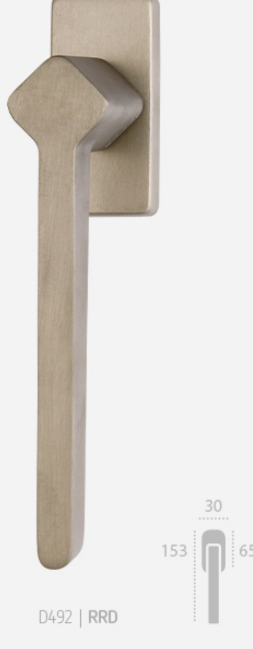
D492 | RRD