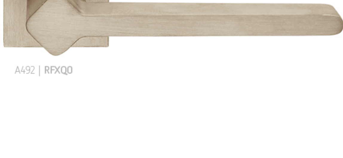
A492 | RFXQ0