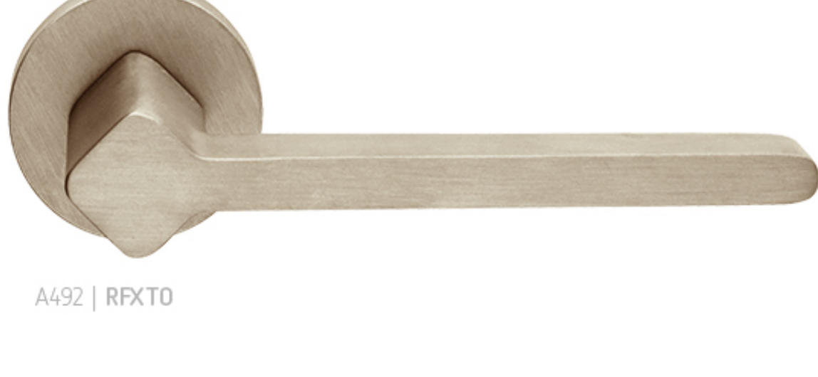
A492 | RFXTO