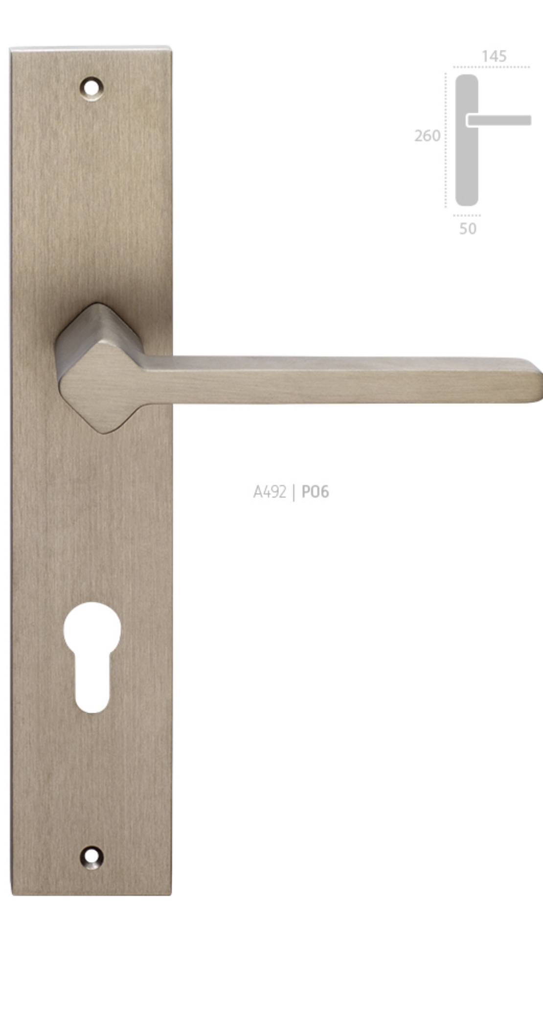
A492 | P06